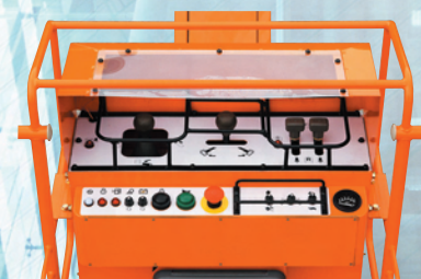
Operating panel designed for safety (Upper control panel)

Notes : Photos include optional equipment. Some of the photos in this brochure show an unmanned machine with attachments in an operating position. These were taken for demonstration purposes only and the actions shown are not recommended under normal operating conditions.